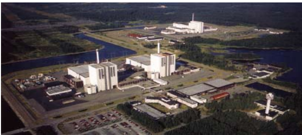
Forsmark nuclear power plant.

Vattenfall AB has majority ownership in seven reactors in Sweden, three boiling water reactors (BWR) at Forsmark (together 3 090 MW and app. 23 TWh/year) and one BWR and three pressurized water reactors (PWR) at Ringhals (together 3 550 MW and app. 25 TWh/year). They are base-load plants of the Swedish electricity system.