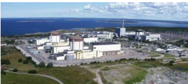
Ringhals nuclear power plant.